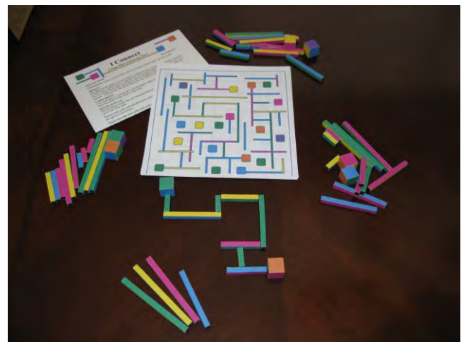
Picture of a prototype for iConnect

Please check them out at www.learningresources.com